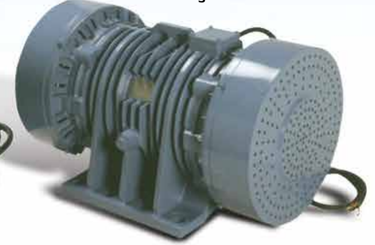
Vibrator — Eight Poles