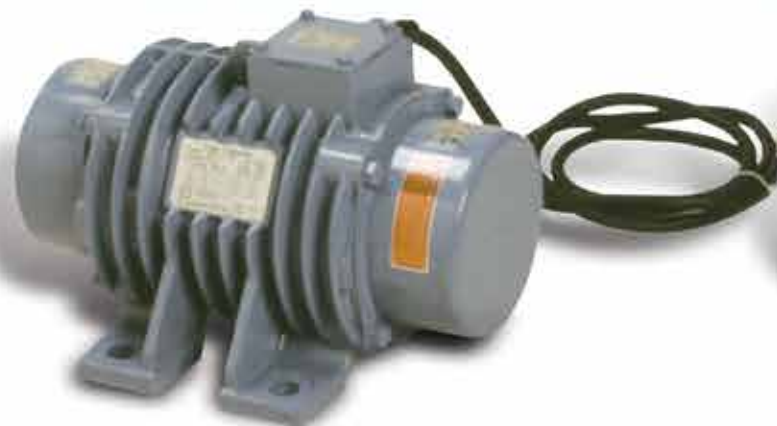
Vibrator — Two Poles

The single impact vibrator acts as a pneumatically operated sledgehammer with force control. Single impact vibrators create a direct impact, which makes them ideal for use with sticky materials because they are less likely to cause packing compared to continual vibration. The use of ported exhaust reduces noise level making them very tolerable in working environments.