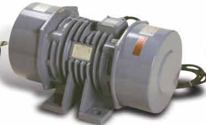
Vibrator — Four Poles