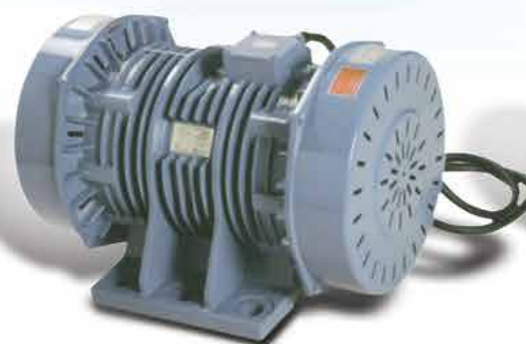
Vibrator — Six Poles